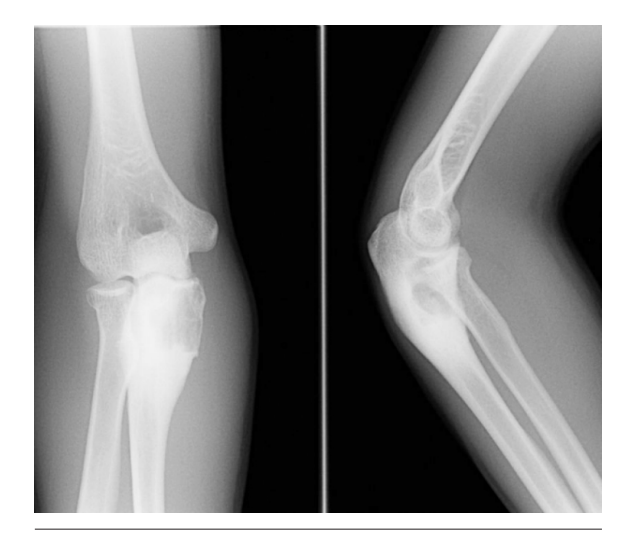
Figure 1: Frontal and lateral radiograph of elbow shows an expansile osteolytic lesion with a narrow zone of transition and surrounding sclerosis in the proximal metaphysis of the right ulna.

imaging (T2WI) and isointense to skeletal muscle on T1-weighted imaging (T1WI) [Figure 2a and b] and showed internal trabeculae. Mild rim enhancement was present on the post-contrast fat-saturated (FS) T1WI [Figure 2c]. Computed tomography (CT) showed a lobulated osteolytic lesion with well-defined margins, internal trabeculae, and surrounding sclerosis [Figure 3a]. Technetium-99m-methylene diphosphonate (<sup>99m</sup>Tc-MDP) bone scan revealed a focus of intense tracer uptake in the proximal ulna [Figure 3b]. No abnormal tracer uptake was detected elsewhere. Based on