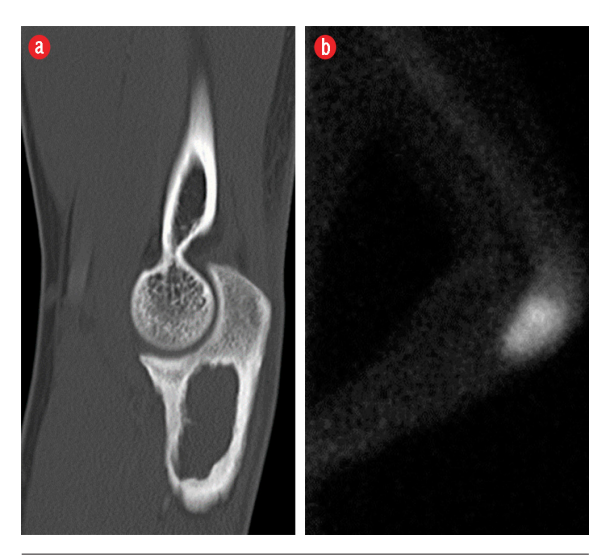
Figure 3: (a) Sagittal reconstructed computed tomography image showed a lobulated osteolytic lesion with well-defined margins, few internal trabeculae, and surrounding sclerosis in the proximal metaphysis of the ulna. (b) Technetium 99m-methylene diphosphonate bone scan showed a focus of intense tracer uptake in the proximal ulna.

the patient's age and imaging features, differential diagnosis raised were those of a non-aggressive bone tumor, such as fibrous dysplasia, giant cell tumor, and aneurysmal bone cyst. The patient underwent open surgery involving open biopsy and curettage, followed by bone grafting. Histopathology revealed proliferative, branching blood vessels within the tissue lined by endothelial cells with solid nests of bland epitheliod endothelial cells [Figure 4a and b]. CD31 immunomarker showed endothelia in the proliferative vessels with patent lumina [Figure 4c]. The final diagnosis was IH. The patient had an uneventful postoperative course. On six-month