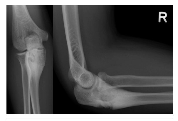
Figure 5: Follow-up frontal and lateral radiographs of the right elbow after six-months revealed areas of sclerosis in keeping with expected healing.

trabeculae. The lesion may have spiculated periosteal reaction. In rare cases, medullary hemangiomas may appear completely lucent on radiographs as in our case.1 On CT, long bone IH corresponds with its appearance on radiographs and are seen as an osteolytic lesion with internal trabeculae.<sup>5</sup> These CT findings were similar to our case. In some cases, the thickened vertical trabeculae give a 'polka dot' appearance as seen in the spinal variety.<sup>3,5</sup> Long bone IH have a variable appearance on MRI and may show low, intermediate, or high signal intensity on T1WI. The hyperintense signal sometimes seen on T1WI may be due to the fat content within the lesion. On T2WI, IH typically appears hyperintense due to the fluid content of the tumor vessels. T1 and T2WI characteristically may show hypointense internal trabeculae within long bone IH as in our case.<sup>3</sup> On post-contrast FST1WI images, long bone IH may show marked to minimal or no enhancement.<sup>1,6</sup> The MRI findings of long bone IH are variable